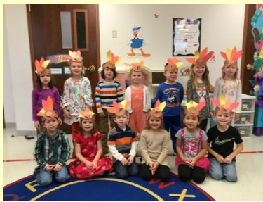
A few of our little turkeys!

We hope you had a wonderful Thanksgiving celebrating with those you love. We enjoyed seeing many special guests at our preschool sharing party to join us for stone soup! Thanks for sending in all the ingredients to help make that possible!